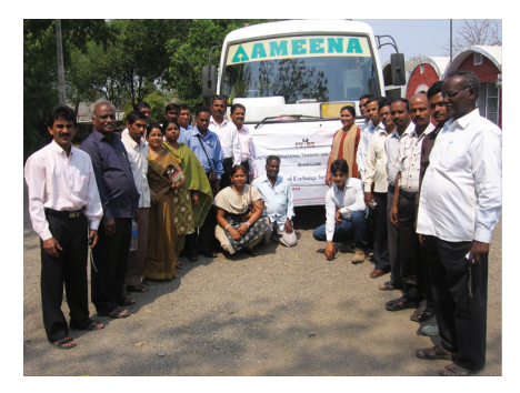
Nagpur Exposure Visit

Two-day Partners' Exposure and Exchange Meets were held at Nagpur on 9-10 March and at Ranchi on 12-13 March. Fifty-five representatives including chief functionaries, coordinators, and