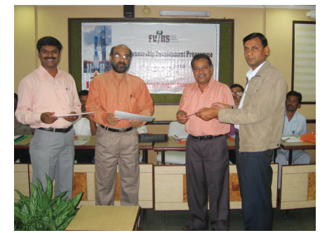
Bhubaneswar ToT Programme

Some of those who have been trained at these workshops are conducting similar programmes in regional languages in their respective States.