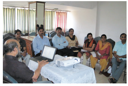
Staff Education Garden, Aguada Fortress and the beaches of Goa were visited.

The three-day education tour was organised from 27 to 29 January 2010. Places of interest such as the St. Francis Xavier' Church, St. Francis of Assisi and Archeological Museum, Spice Plantation