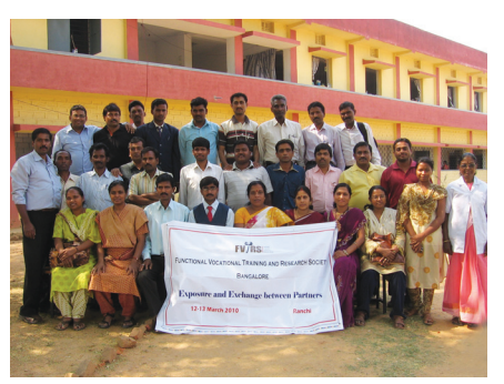
Ranchi Exposure Visit

instructors of partnerorganisations from the States of Uttar Pradesh, Chhattisgarh, Madhya Pradesh, Jharkhand, Orissa, West Bengal, Maharashtra, and Karnataka participated.