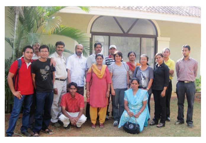
Members of the Staff