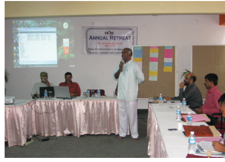
Annual Retreat 2009

Presentations on relevant topics that included challenges in VET as faced by the country today, RTI Act and its implications for FVTRS partners, Advocacy and Lobbying, Resource Mobilisation, Monitoring and Evaluation of projects, and how Regional Marginalization leads to Movements and on inclusion